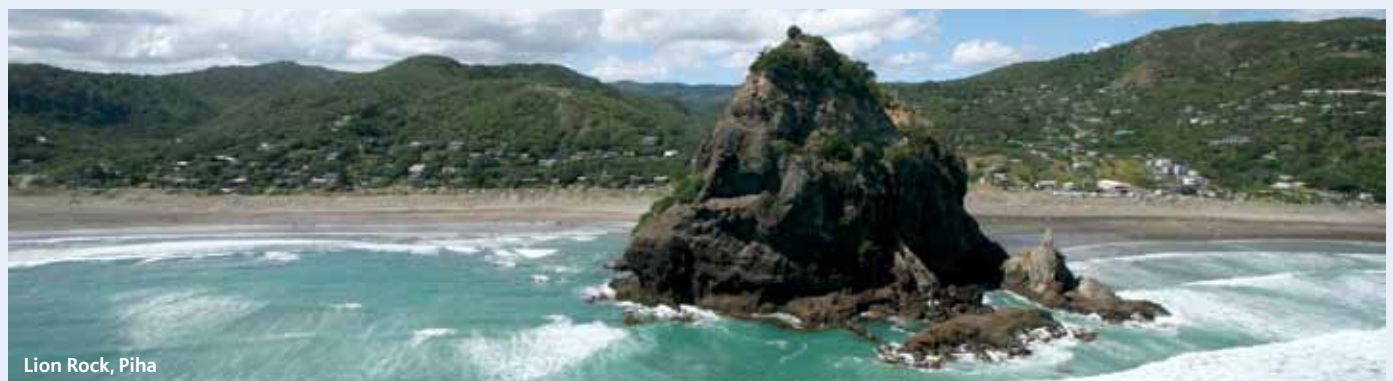
Lion Rock, Piha

What are your views on this proposed approach to manage mangroves?