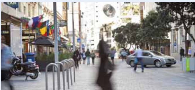
Fort Street shared space