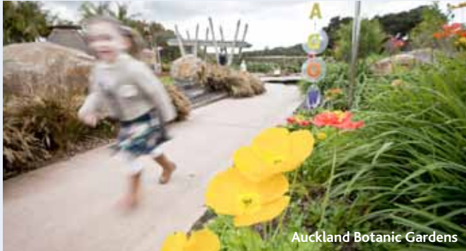
Auckland Botanic Gardens

There are currently 31 Open Space zones in the existing District Plans. The draft Auckland Unitary Plan proposes replacing these with four: Conservation; Informal Recreation; Sport and Active Recreation; and Civic and Community Spaces. The draft plan proposes one zone to replace the myriad of zones and different approaches for Auckland's major sport and recreation facilities. Different precincts will be used to take account of the different requirements of these facilities, which range from sports stadia such as Eden Park, through to the Zoo and MOTAT.