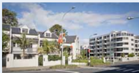
Terraced Housing and Apartment Building